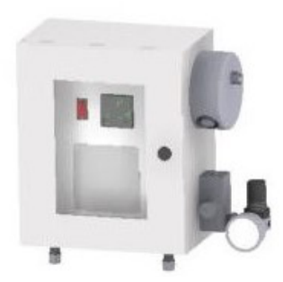
Controller with optional Z-Purge